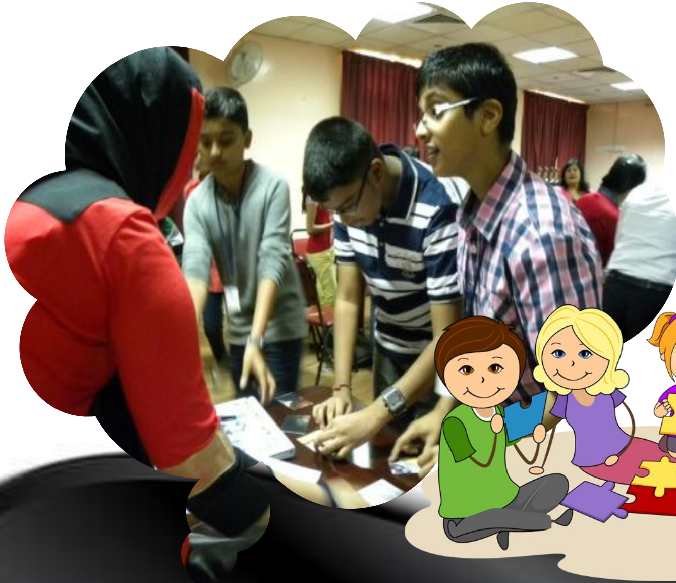
Puzzle Icebreaker Game